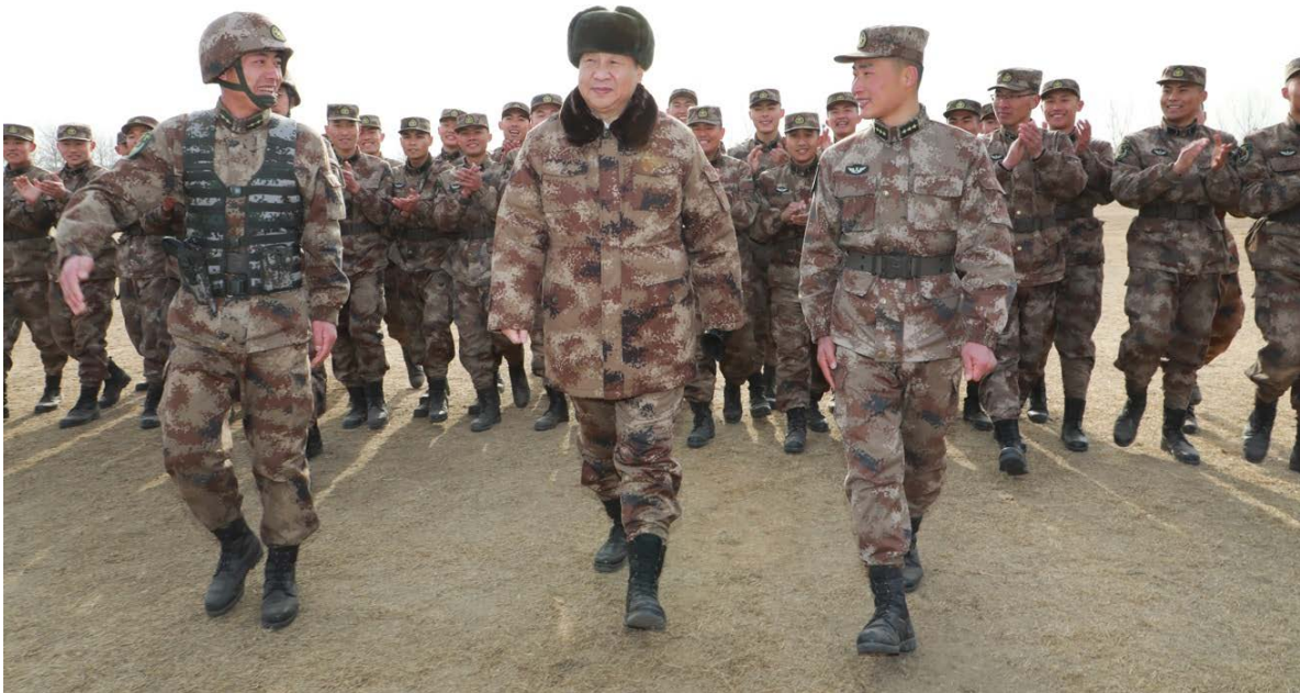
Chinese President Xi Jinping (centre) talks with officers and soldiers during an inspection of a division of the People's Liberation Army in the Central Theatre Command on January 3.

Similarly, the recent shelving of police forces under the large tent of the People’s Liberation Army has been depicted as more personal-power consolidation. One hardly need descend into the conceptual chaos of modern psychiatry to imagine at least a measure of personal worry.