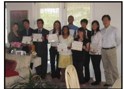
Project Bridge 2007-2008 graduation

In our efforts to improve the program for the future, we will create a standardized Project Bridge handbook, and other volunteers will work to compile an adequate database of former Youth Ambassadors. The overall goal is to formalize the program so that we can execute the program more efficiently and continue to be an incomparable intercultural outreach and leadership program.