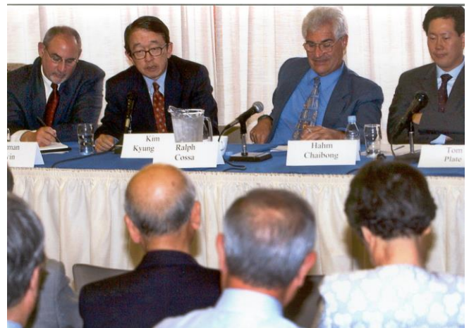
Panelist for the Pacific Forum event held on the UCLA campus on May 19.