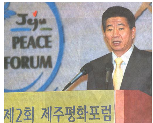
President Roh Moon-hyun delivers a keynote speech at the 2 nd Jeju Peace Forum